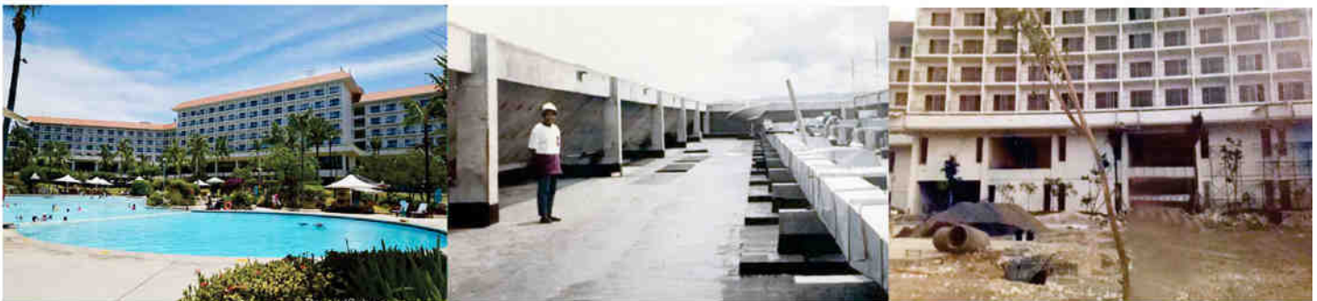
SHANGRI-LA, MACTAN, CEBU (1993)

We were contracted by John Holland Construction, Inc. to waterproof all the toilets and bathrooms, and the roofdeck of the hotel.