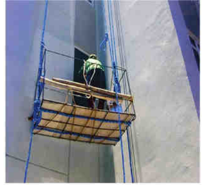
SCANDIC PALACE CONDOMINIUM, MAKATI