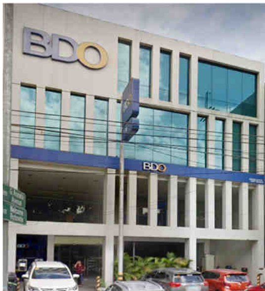
BDO ACCREDITED CONTRACTOR