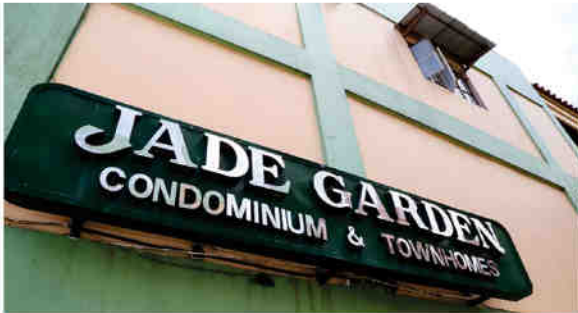
JADE GARDEN, VALENZUELA (1992)

Jade Garden is one of our first major projects. Our services were engaged to waterproof all its toilets and bathrooms, and its swimming pool.