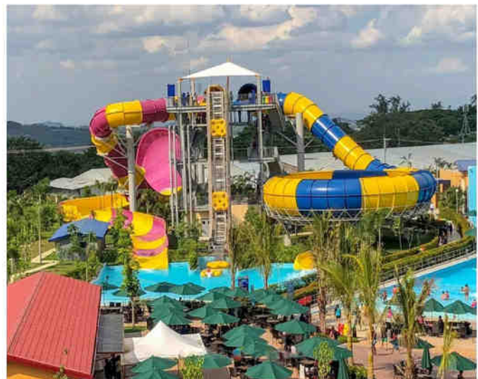
AQUA PLANET SWIMMING POOLS CLARK, PAMPANGA