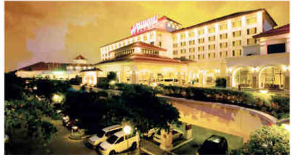
WATERFRONT AIRPORT HOTEL & CASINO, MACTAN, CEBU (1993)

Jade Garden is one of our first major projects. Our services were engaged to waterproof all its toilets and bathrooms, and its swimming pool.