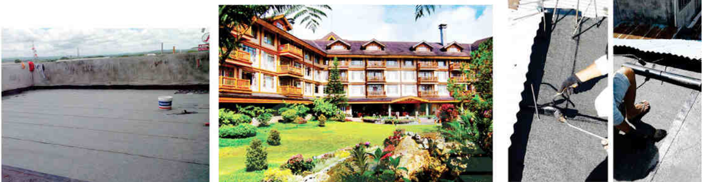
CAMP JOHN HAY HOTEL, BAGUIO (1998)

Our hotel ventures continued. In the same year, we were entrusted by DM Consunji, Inc. to waterproof the toilets and bathrooms, roofdecks, concrete gutters, and the plant boxes of the hotel's first phase and its extension.